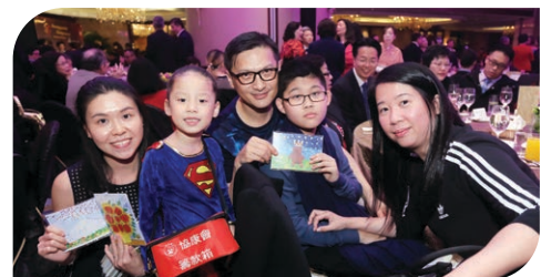
Famous artists Mr Sunny Chan Kam-hung (middle) and Ms Ada To Man-wai (first from right) attend the event with their son.