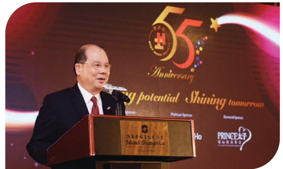
Guest of Honour, Mr Matthew Cheung Kin-chung, Chief Secretary for Administration of HKSAR, commends the Society for its achievements over the past 55 years during his speech.

The funds raised from the Charity Dinner were donated to the Society's Children and Youth Training Fund. During 2013-2017, the Society has appropriated over HK$10 million to subsidise more than 2,500 child and youth with special needs from low-income families in receiving assessments and training from psychologists, therapists and pre-school teachers.