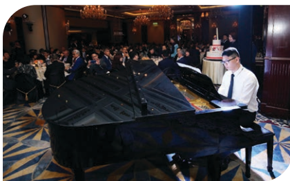
The children and youth of the Society perform on stage and impress the guests with their abundant talent.