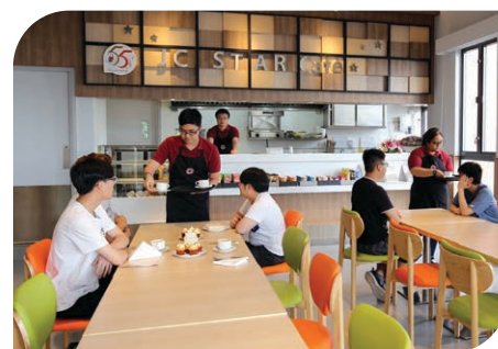
Jockey Club STAR Café cum Community Support Centre