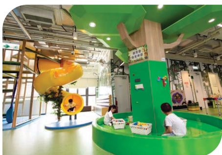
Jockey Club Supportive Learning Project Fun World cum Parents Resource Centre